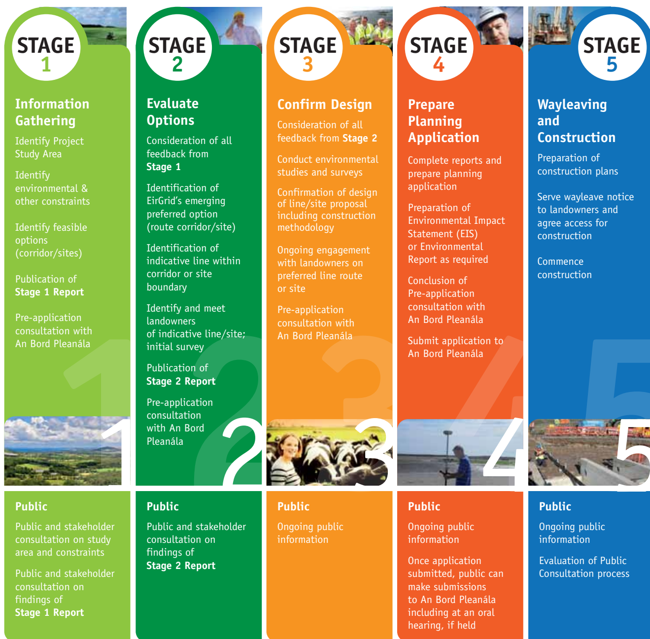
Figure 1. The EirGrid Roadmap